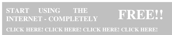
Exhibit B(2): Next banner ad panel