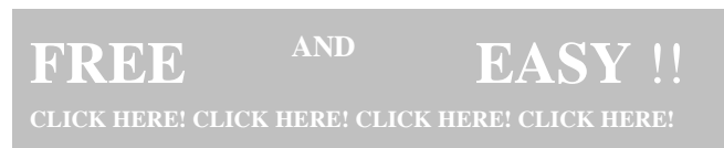
Exhibit B(1): Initial banner ad panel

Exhibits B(1) through B(5): Banner ad for respondent’s Premium Web service with click-through display screens. This banner ad was disseminated throughout the World Wide Web and embedded into the top border of electronic mail messages viewed by subscribers of respondent’s electronic mail services. The banner ad consists of several different panels that automatically rotate, each of which, when clicked, leads consumers to a series of promotional and registration screens.