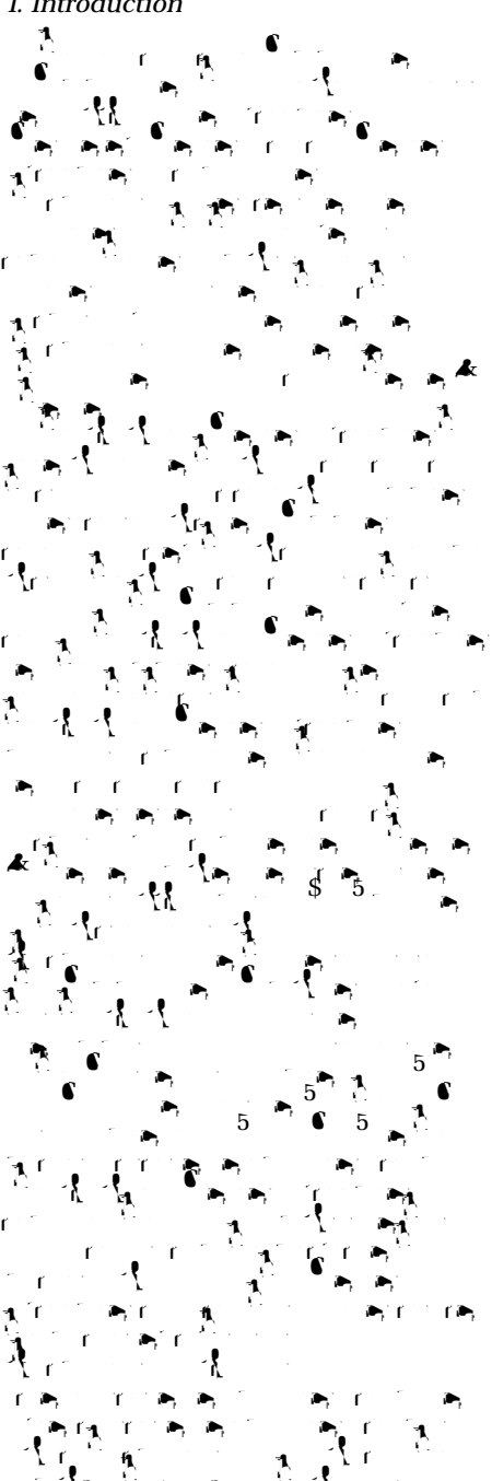
II. The Products and the Structure of the Market